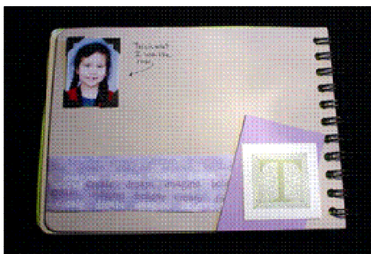
Inside Spread: Section #2: My Tooth-by-Tooth-Loss Experiences