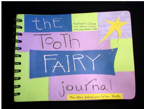
Front Cover Idea: The Tooth Fairy Journal